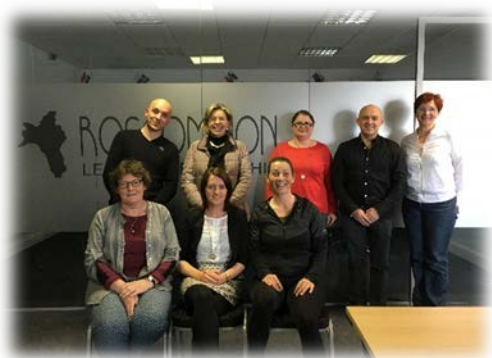
Project Partners pictured at the kick off meeting in Roscommon